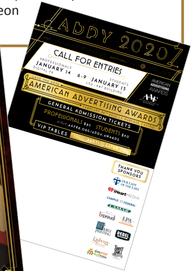
Postcard mailing to Advertising and Marketing Professionals